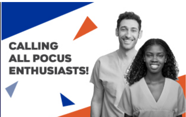
IVC Certificate Development