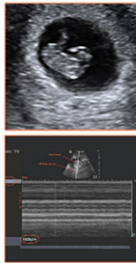
First Trimester Determining Intrauterine Pregnancy (IUP)

Click the button below to view the full infographic on our website! PDF versions are available to download.