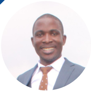
Hastings Isaac Banda