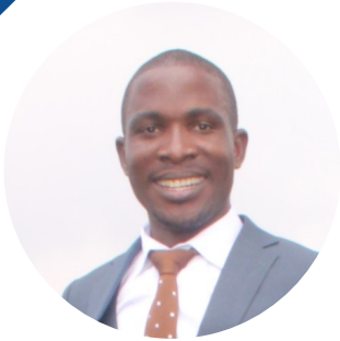
Hastings Isaac Banda